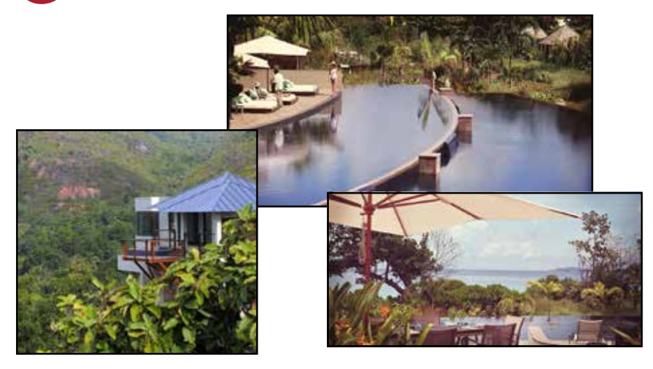
Escape to a Stunning Indian Ocean Oasis in Praslin, Seychelles for Seven Days & Six Nights at the Raffles Seychelles for Two (Land Only)

Cradled in the original Garden of Eden, laid-back luxury make Raffles sublimely perfect, an oasis of time, space and place favored by Europe's elite and royalty - the Duke and Duchess of Cambridge.